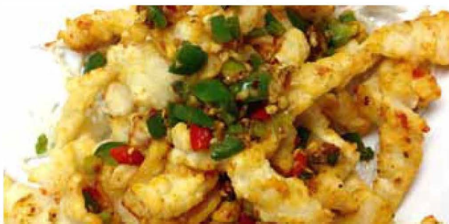
🍴 Salt & Pepper Squid