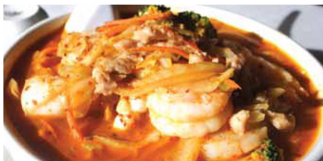
Chilean Sea Bass with Tofu